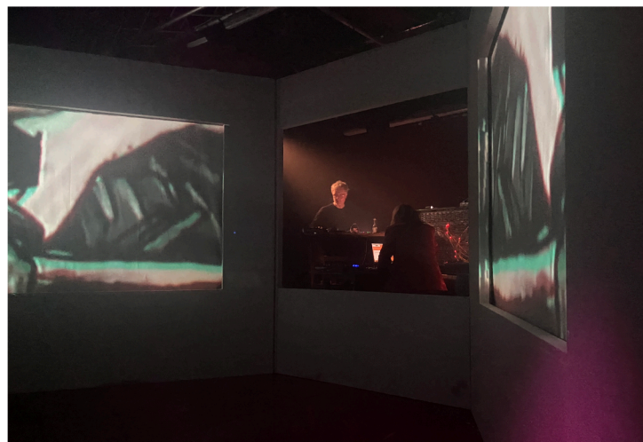
PØNG @ circus mirage, Dresden, Germany

From festivals and galleries to clubs, churches and public spaces, PØNG adapts each performance to its context.