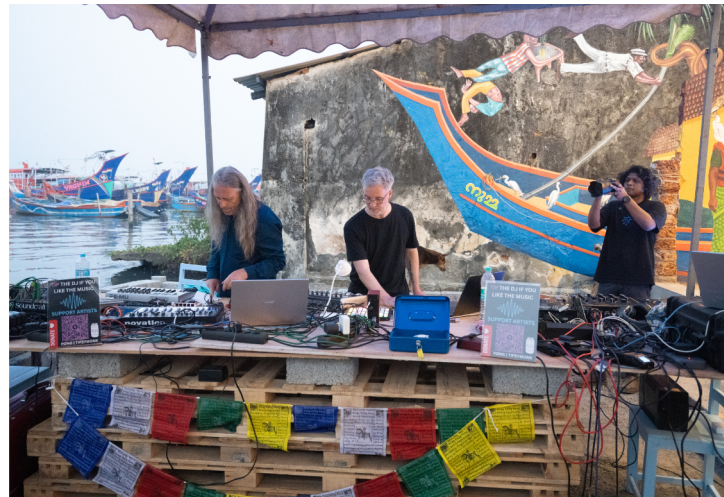
PØNG @ ARMAAN COLLECTIVE, Kochi, India

Combining analogue synthesizers, field recordings, digital production tools, modular systems and real-time media processing, each performance unfolds as a unique encounter shaped by space, audience and moment.