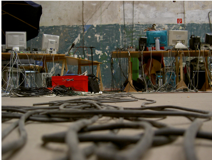
Installation at the European Centre for the Arts, Dresden, Germany

Each installation is developed in response to its location, architecture and social context.