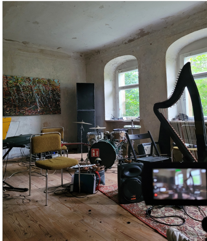
WORKSHOP @ Musiksommer Bärenstein, Germany

Workshops for children, young people and adults, regardless of prior experience