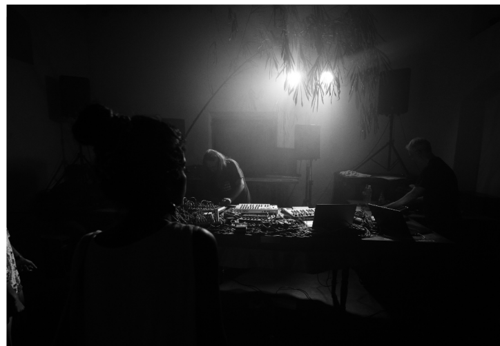
PØNG @ forplay-society, Kochi, India

Every performance is created in real time. Sound, audience and environment continuously influence the artistic process.