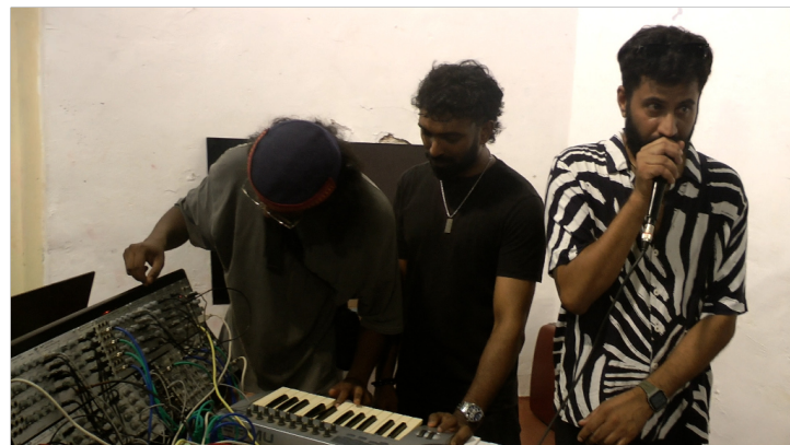
WORKSHOP @ forplay-society, Kochi, India